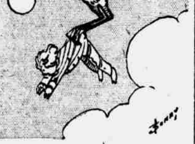
SHE FOUND IT A TICKLISH WAY TO TRAVEL.

Flashes of lightning from the approaching storm and occasional