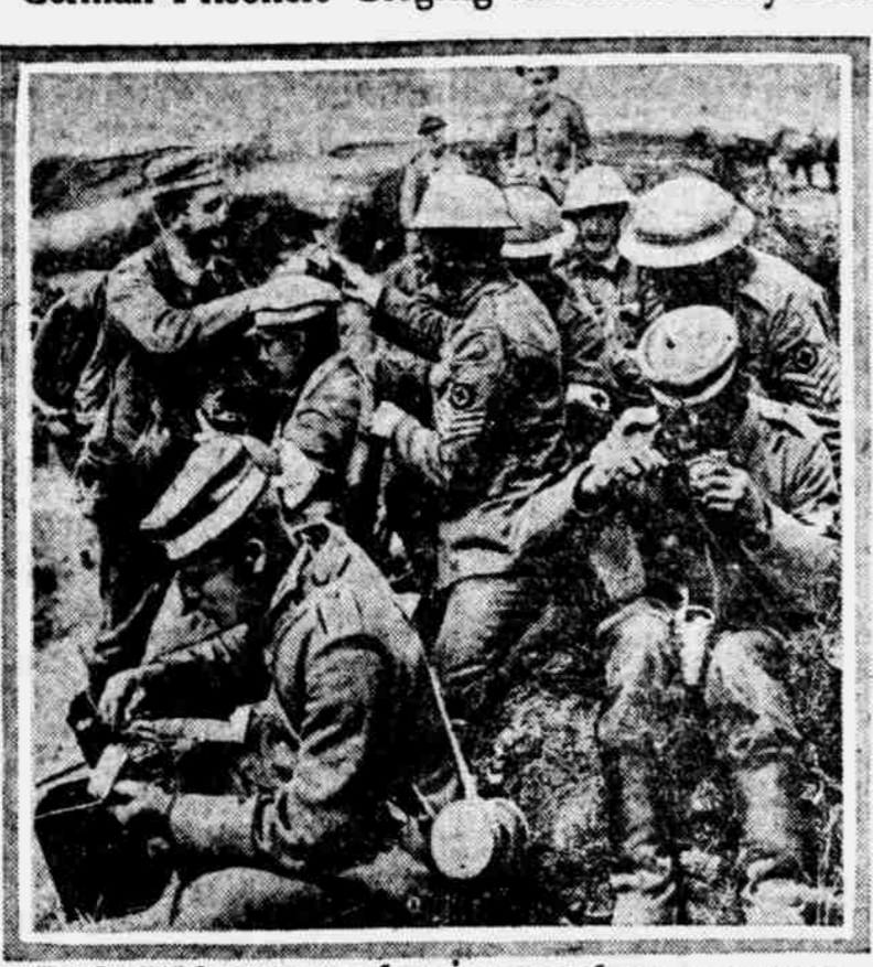
ENJOYING BRITISH 'BULLY BEEF' GERMAN PRISONERS

1918 Draft Men Called in Third District for California and Texas. Men called to report for assignment to Camp Bowie, Texas, and Camp Kearny, California, between October 21 and October 25, by local board for division No. 3: