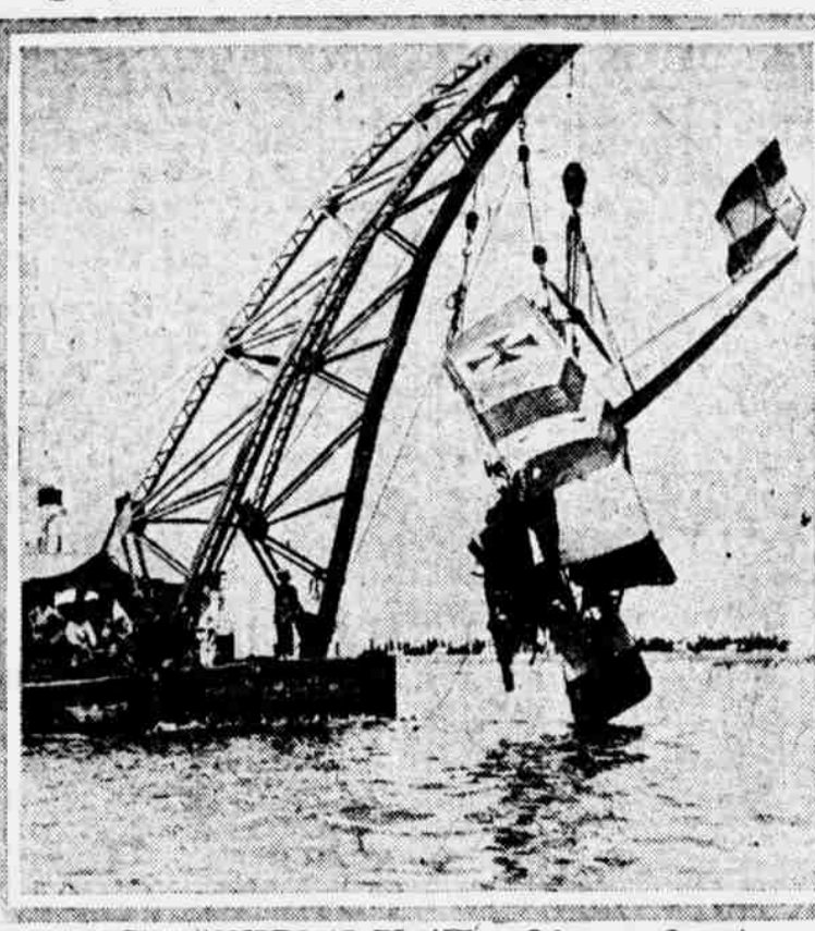
DESTROYED AUSTRIAN PLANE.