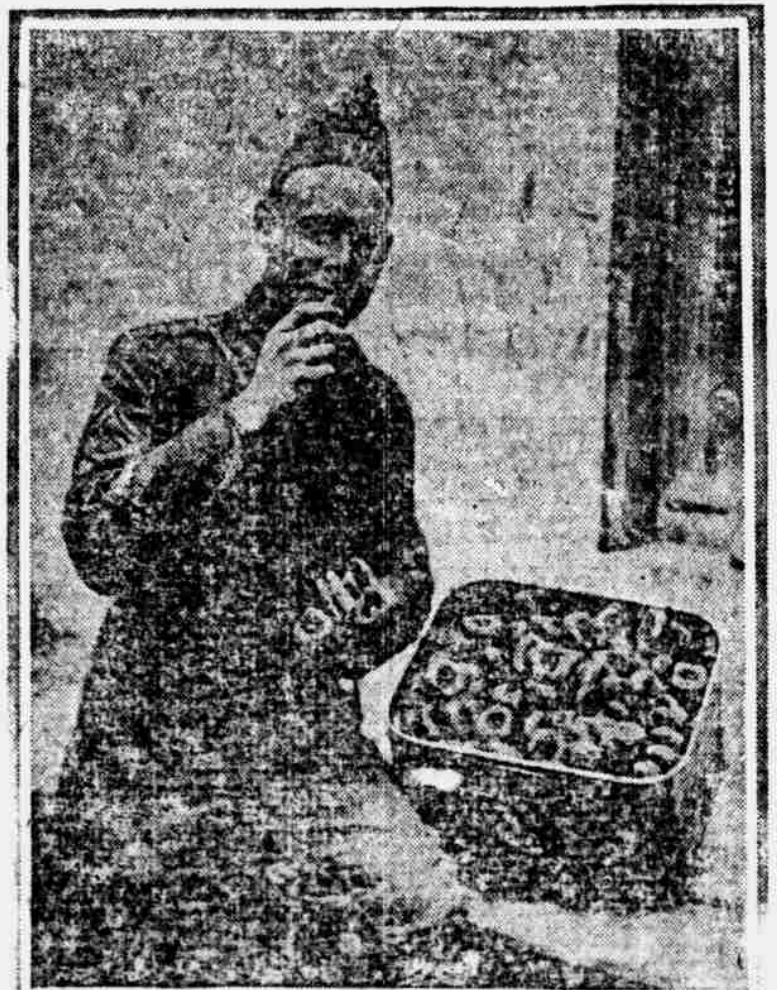
DOUGHNUTS FOR THE DOUGHBOYS.

field runner. He is a product of St. Yankee Soldier Enjoying Salvation Army Doughnuts