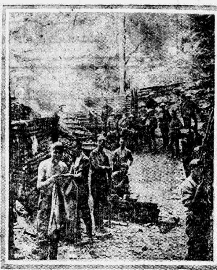
CLEANING UP AFTER THE FIGHT.