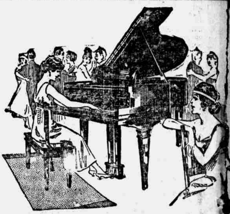
Brambach Baby Grand The only absolutely guaranteed Grand Piano-it's the A partment Baby Grand

Price $550 SECURE YOUR PIANO NOW Our Monday Sale on USED PIANOS