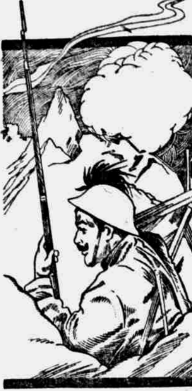
ITALIANS CAPTURE SUMMIT OF MONTE SAN GABRIELE

One year ago today, September 14, 1917. Find a defender.