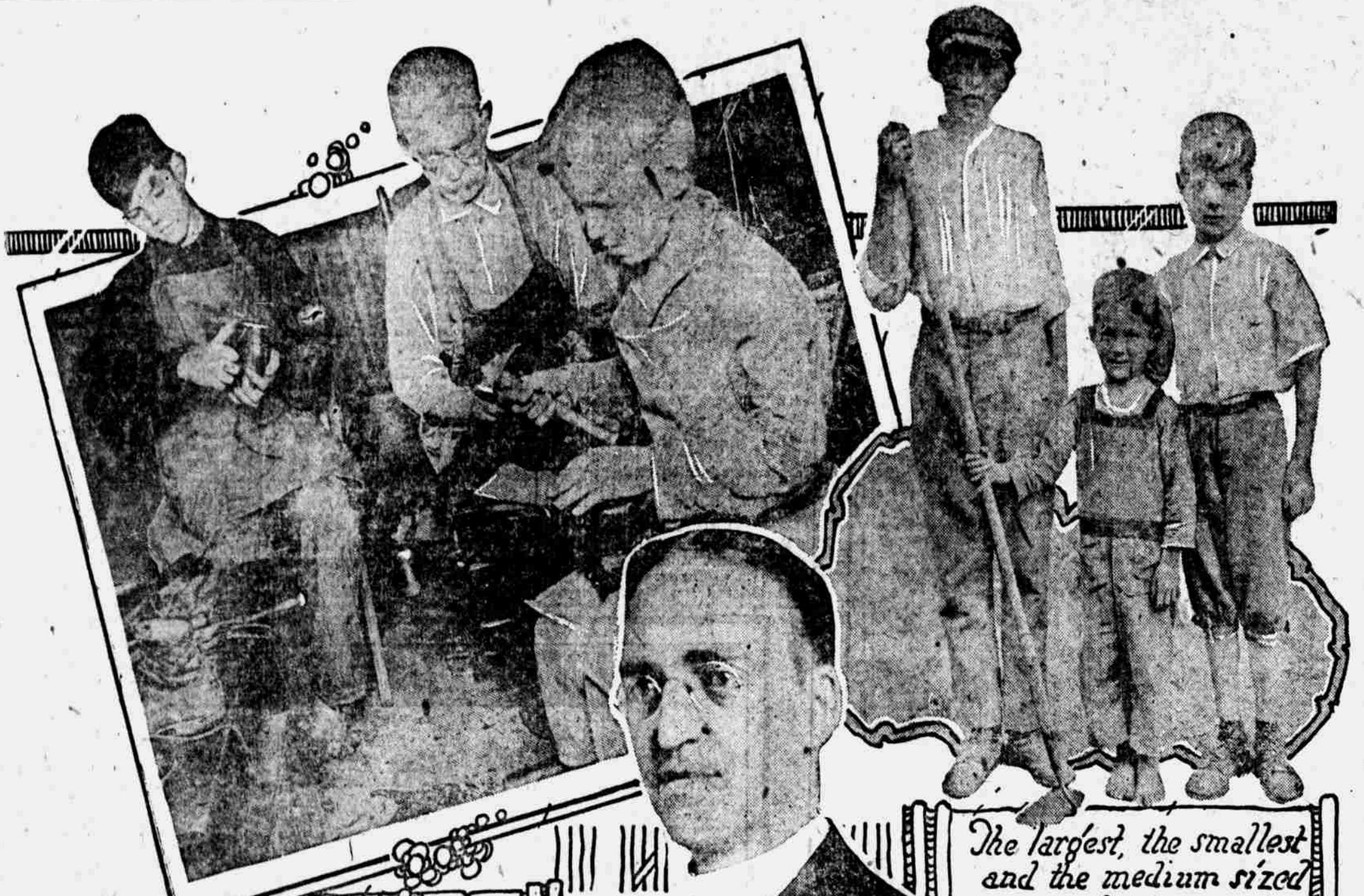
Learning a trade