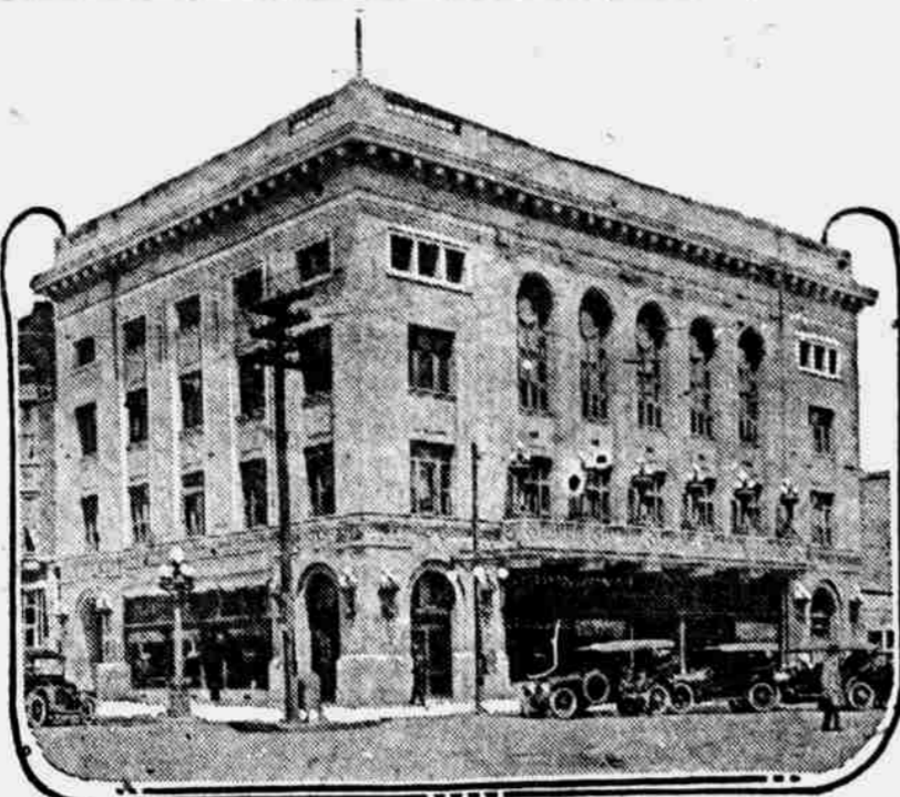
The Lincoln Commercial Club's Own Home - 11th and P Sts.

Snapshots. "Not guilty" is an innocent remark. Today's worry is the result of yesterday's neglect. A beautiful girl is one who is pretty and doesn't know it. Yet the way of some transgressors is altogether too smooth. About nine-tenths of what people say doesn't amount to anything. Every old lady likes to tell how beautiful she was when she was a girl. If a married man admits he is a fool it is his wife's duty to agree with him. When a young man tells a girl that he loves her for herself alone it's equivalent to injunction against the rest of the family. —Chicago News.