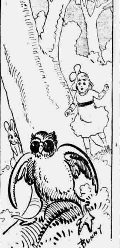
JUDGE OWL WAS NOW ABLE TO LEAD THE WAY AT A LIVELY PACE.

CHAPTER I. Peggy Takes a Slide. PEGGY was on a picnic in the woods—a picnic at which she was the only child. She had looked forward eagerly to the outing, hoping for a jolly playtime with the birds. But, like old Mother Hubbard, who went to the cupboard, she suffered a disappointment.