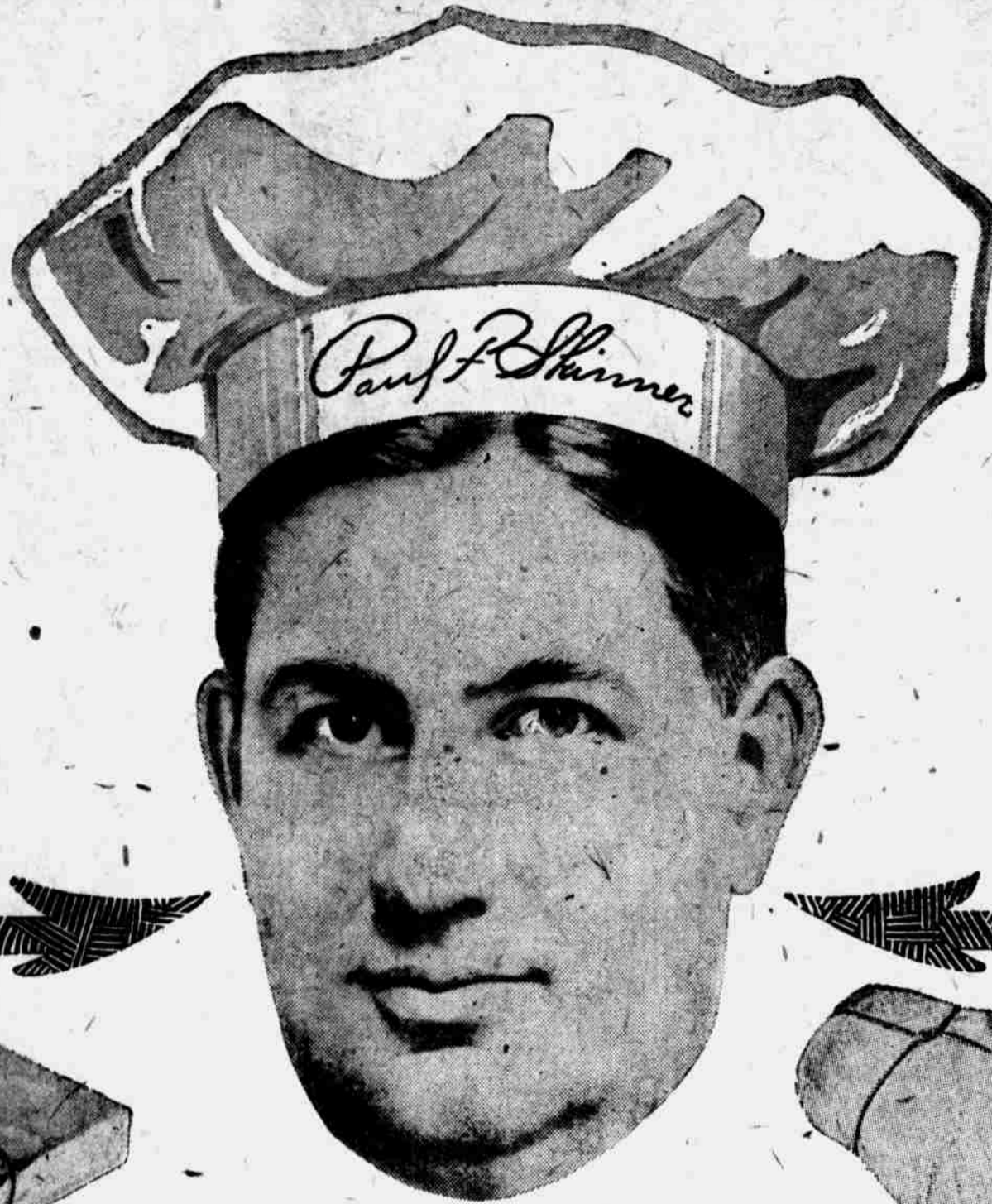
TRADE MARK REGISTERED

This trade Mark is known to every wholesale and retail grocer in the United States and, therefore, the label of the SKINNER PACKING COMPANY will be familiar to our trade the minute we start to ship.