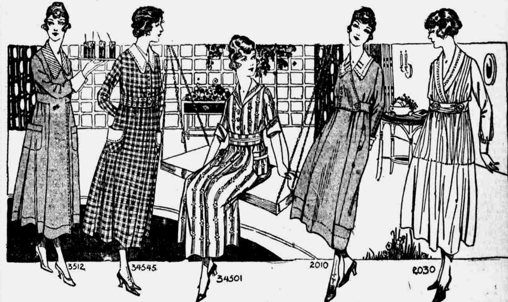
No. 3512—Mina Taylor Hoover Conservative Dress

WE illustrate five splendid styles of these superior dresses, models suitable and desirable for any occasion; the values are unusual.