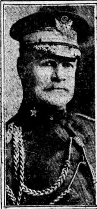
MAJOR-GENERAL H. LIGGETT

Maj.-Gen. Hunter Liggett is slated to command the first United States army corps, which is being organized in France, according to information from Washington. General Liggett is 59 years old and has served in the army 37 years.