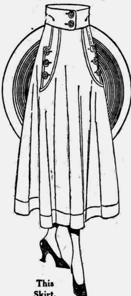
This Skirt, $3.95

WASH SKIRT made of "WRINKABLE" Gabardine, trimmed with white pearl buttons, special at... $3.95