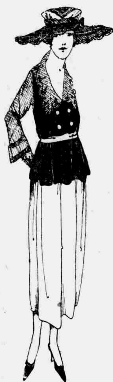
By GERTRUDE BERESFORD.

That the sleeveless coat may be a very dressy affair is proven by this model of American beauty silk poplin, with its accompanying collar and sleeves of sheer net and lace. White pearl buttons and a white belt and silk skirt complete a very striking costume indeed. The lingerie hat of lace and net carries a ribbon and covered wire of American beauty velvet, and is a most attractive complement to wear on summer afternoons and evenings. Robin's egg blue or pink will develop this jacket very charmingly.