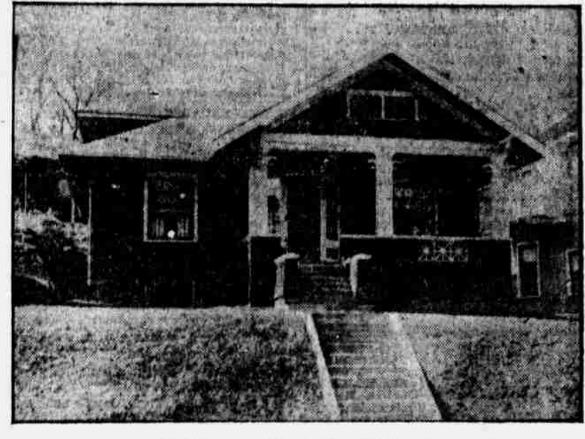
Located on South First Street.

This beautiful home consists of six rooms on first floor and two on second; splendid hard pine finish throughout; built-in buffet; cemented basement with laundry; lot 50x150. On car line and only four blocks from Broadway. Price $6,750. $2,000 cash, balance to suit purchaser.