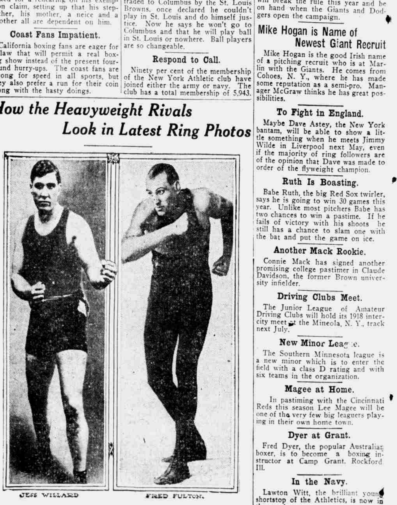
JESS WILLARD FRED FULTON.

In the Navy. Lawton Witt, the brilliant young shortstop of the Athletics, is now in the naval reserve.