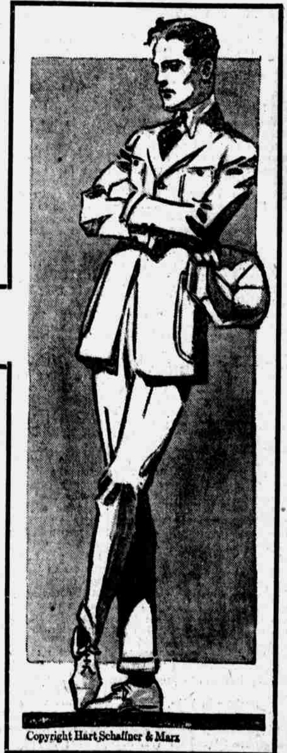
Copyright Hart Schaffner & Marx