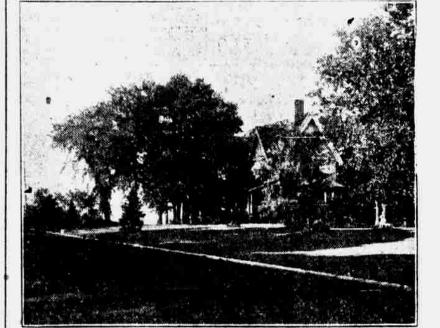
HIS PRESENT HOME.

tion of his responsibility as life. Although the Omaha and Florence together in a continuous line of pavements, and the Omaha and Florence together in a continuous line of pavements, and the Omaha and Florence together in a continuous line of pavements.