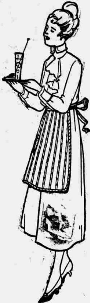
B-5502 —Band Apron; a good quality light percale, fancy edged, patch pocket; a very well made apron and you will want half a dozen of them at this price. 35c value, at 23c