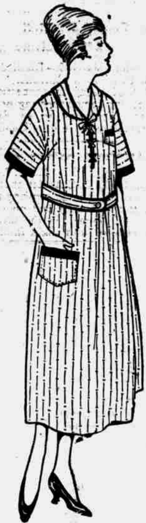
B-5501 —Full Length Middy Style Bungalow Apron, fancy sailor collar, two fancy trimmed pockets, made of good quality light, fancy figured percale; sleeves, pockets, belt, collar and front faced with plain blue; regular $1.25 value, each, at 79c

These are all brand new styles, bought by our personal representative in New York and just received — our immense buying power permits us to quote the very lowest prices.