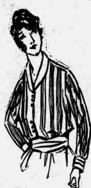
B-5508 —Satin Striped Crepe de Chine Blouse; a positive wonder at this low price. Various color stripes; sizes 36 to 44; newest style collar, etc. A wonderful material and newest Spring style blouse, all combined with $2.95 a low price. Each