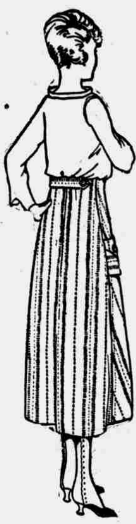
B-5503 —All-Wool Sport Skirt, fancy stripe material, two big fancy pockets, fancy light stripe all wool material; a splendid skirt for both Spring and summer wear; a positive $5 value, each only $2.95