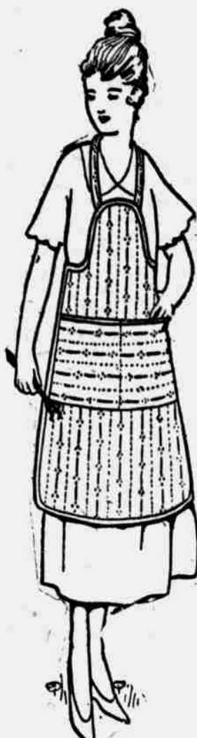
B-5504 —35c for a Wonderful Apron Value; new knitting style or sewing apron; piped with blue; good quality light figured percale; an extremely becoming work or knitting style; only 35c