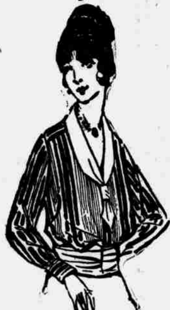
B-5507 —Striped Gingham Silk Blouse —the newest silk material, assorted fancy stripes, new fancy roll collar and "Johnny Boy" tie effect; sizes 36 to 44; you will marvel that it is possible to sell such fiber silk Blouses for so low a price when you get one; $2.95 each, only