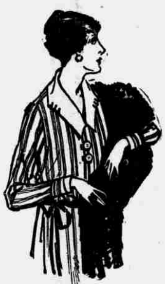
B-5506 —Crepe de Chine Silk Blouses, newest spring styles, the new Byron collar effect; sizes 36 to 44; colors are white and flesh. A simple, but extremely charming style. A wonderful blouse value; each, $2.95 only