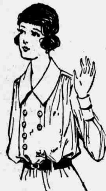
B-5509 —Satin Striped Tub Silk Blouse — large, fancy collars, fancy button trimmed, correct new Spring style; extra good quality, fancy stripe Tub Silk. This is a remarkable value; send for one. You won't return it; we know, after you see the value we give you. Each, only $2.95