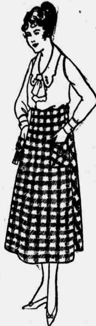
B-5505 —Sport Skirt, fancy black and white plaid —all wool material; two big fancy pockets, just the kind of a fancy skirt for spring and summer wear; a new sport skirt model; a positive $5.00 value, each, only $2.95