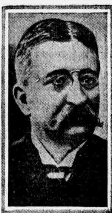
M. STEPHEN PICHON, French Foreign Minister Stephen Pichon has made public documents which prove the German government's determination to force war on France, and also that Berlin demanded the fortresses of Toul and Verdun as a guarantee of French neutrality in the war with Russia.

"We have known only recently the authenticity of these documents," said the foreign minister. On July 31, 1914, von Schen, German ambassador to France, was charged in a telegram from Chancellor Bethmann-Hollweg, to notify us of a state of danger of war with Russia, and to ask us to remain neutral. What was unknown to us was that the telegram from the German chancellor contained these instructions: "If the French government declares it will remain neutral your excellency will be good enough to declare that we must, as a guarantee of its neutrality, require the handing over of the fortresses of Toul and Verdun; that we will occupy them, and will restore them after the end of the war with Russia."