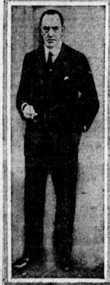
SIR EDWARD CARSON Sir Edward Carson, former minister without portfolio in the British war cabinet, who resigned his place to lead the fight in Ireland against home rule. This photo of the ex-British minister was made after he returned to his home at Drumalico, Larne, near Belfast, Ireland.