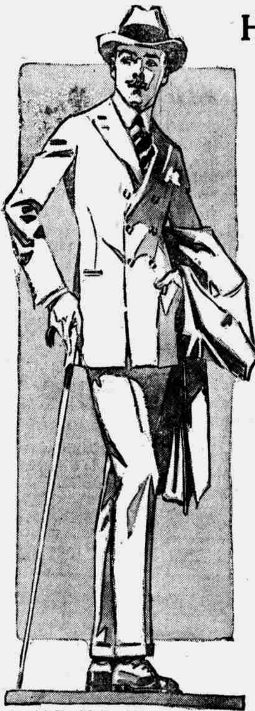
Copyright Hart Schaffner & Marx

More and more the best of everything is being standardized in merchandise as well as manners—and the man who aspires to be well dressed, is just as particular about the label sewed on the inside of the garment as he is about the weave of the cloth and the cut of the garment. THAT IS TO SAY—he pins his faith to a clothing organization that stands for character of output rather than quantity.