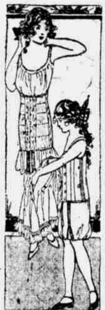
For the College Girl

It is most important that the young girl wear the proper Corsets—not only for the sake of style, but for her comfort and HEALTH as well.