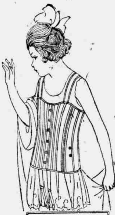
For the School Girl

Our fitters are painstaking and all fittings are made free of charge.