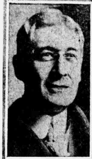
BARNARD M. BARUCH

Bernard M. Baruch of New York, it is reported, has been selected by President Wilson to become chairman of the war industries board. He will succeed Daniel Willard, who resigned. It is understood a general reorganization of the board is to be made to fit more closely with the war-making machinery of the government.