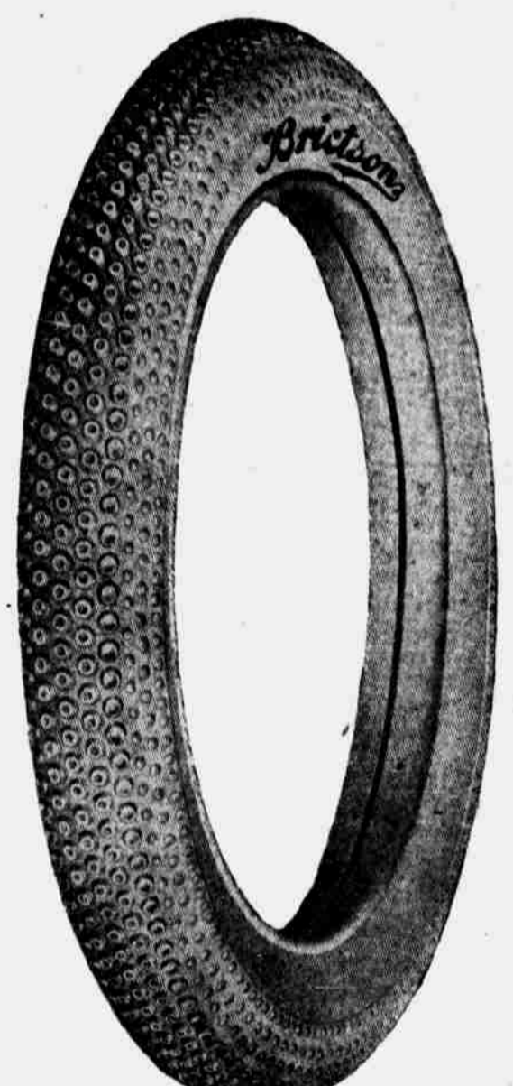
Bricton 10,000-Mile Puncture-Proof Tire A Demonstrated Success.