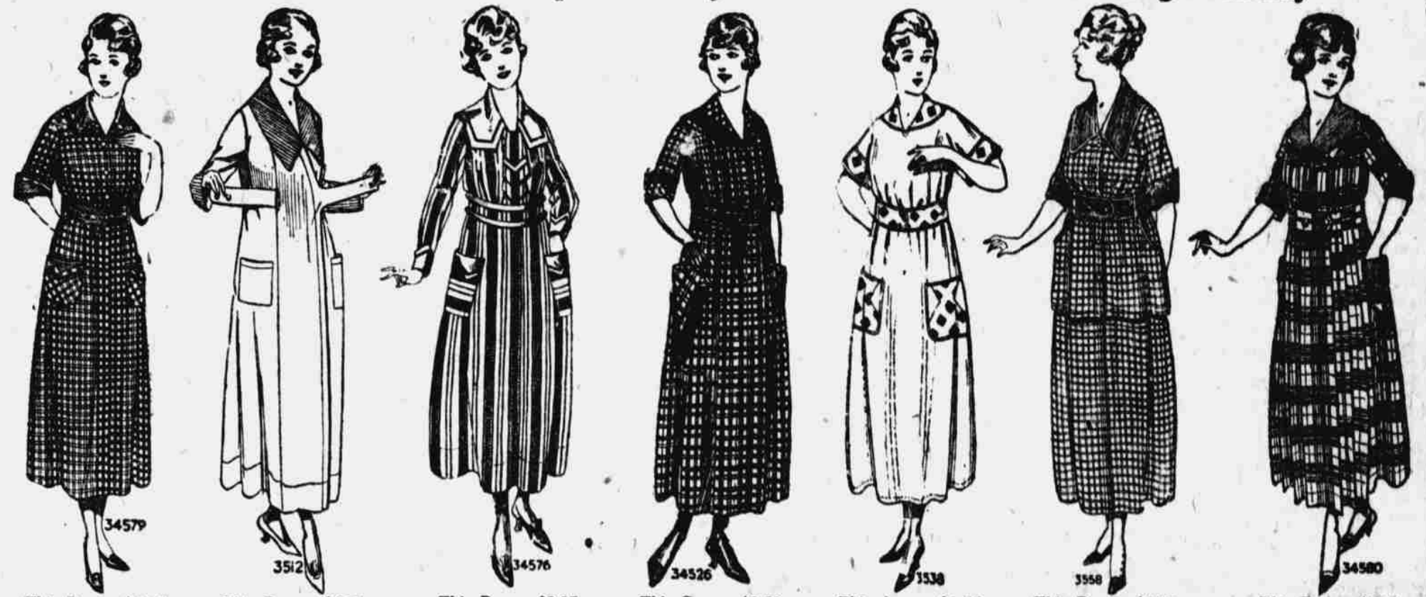
This Dress, $2.25

We Illustrate Seven of the Splendid Styles Featured in This Offering Monday