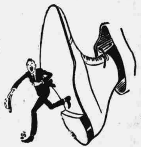
Main Floor, Men's Bldg.

A most complete stock of all the best styles. Made over same last as "Dad" wears. Strong, sturdy, stylish Footwear.