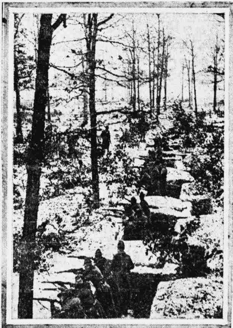
IN THE TRENCHES.

AS IT WILL BE OVER THERE—With the first snow and cold, the boys in training are beginning to realize what winter in the trenches means.