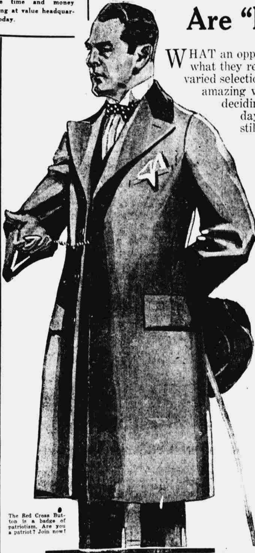
The Red Cross Button is a badge of patriotism. Are you a patriot? Join now!

WHAT an opportunity to give men and young men what they really want this Christmas. Such vast, varied selections of World's Best Clothes and such amazing values give you a double reason for deciding to give "him" a suit or overcoat today. Greater Nebraska standard values still available.