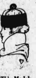
This Model Made of Mirrored Velvet