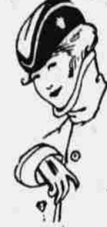
This Model Made of French Felt