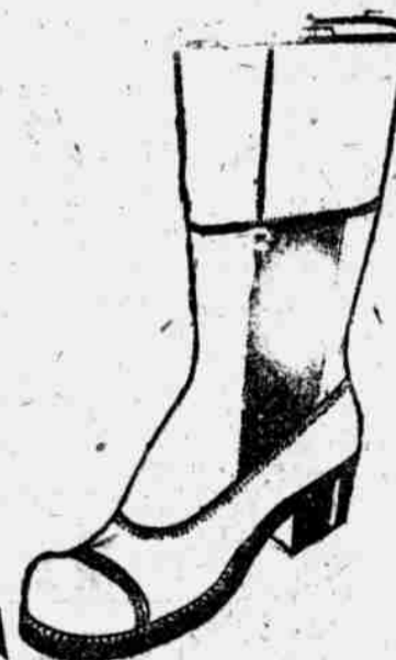
Boots, Calf Boots, Hip Boots, Grain Boots for Less.

Who saves you from $1 to $3 a pair on your shoes. When you buy shoes of Pierce you pay for nothing but shoes---That's Why!