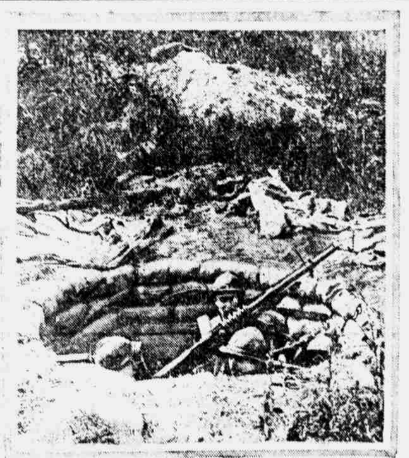
ANTI-AIRCRAFT GUN.