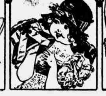
"Oh! I wisht this "Oh! you duckie! What a beauty you was mine! Ma-Ma likes