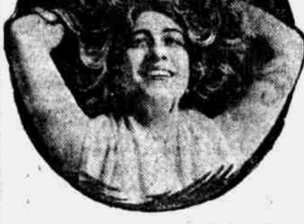
"You Will See a Difference in Length of Your Hair in a Few Days," Says Valeska Suratt, the Movie Queen.