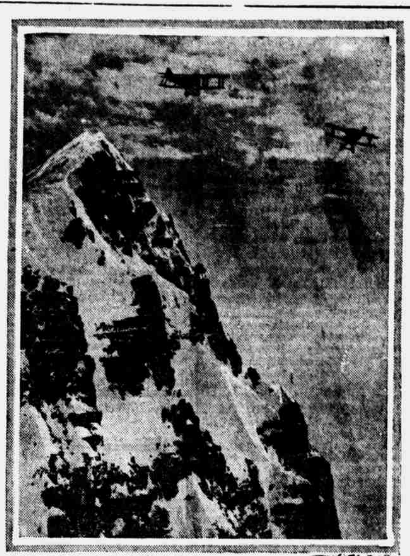
SENTINEL OF THE SKY.

ON WATCH IN THE CLOUDS—High up in the snow-covered Alps, circling above the rocky Dente de Pasubio, the Italian Nieuport Machi, at the left, is chasing away an Austrian aviatik, who attempted to make a raid on the Italian position on the mountain top.