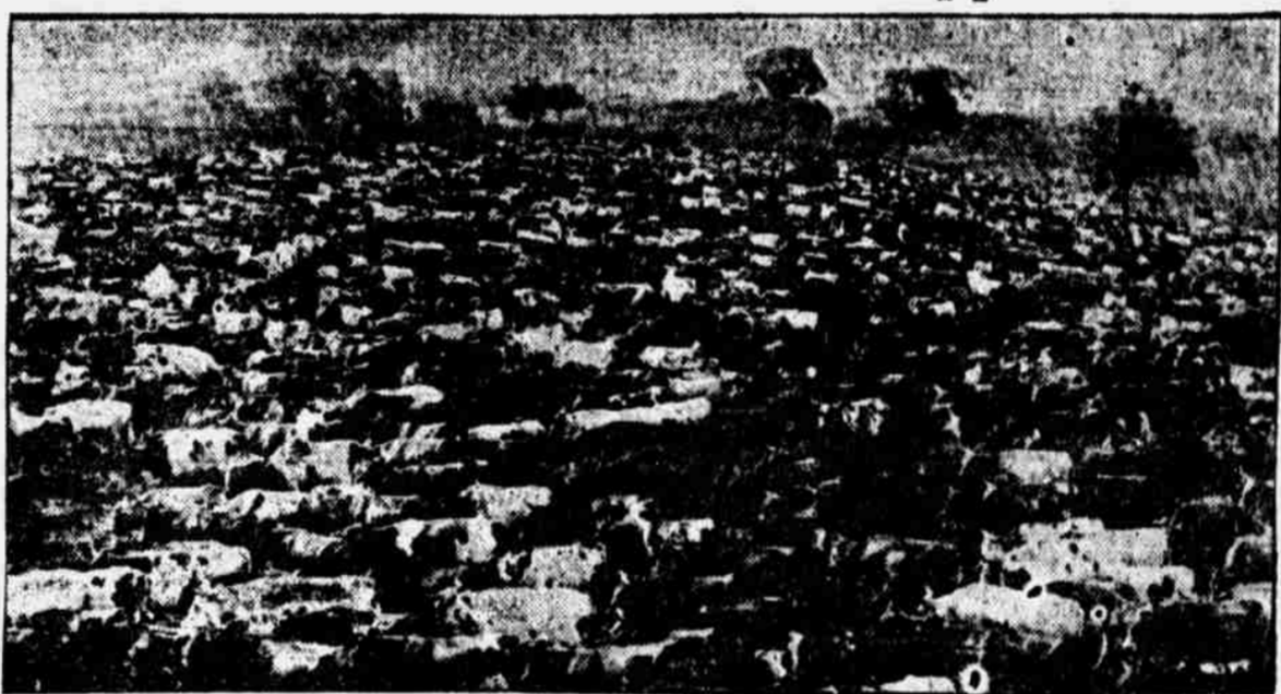
Roundup of 10,000 Head of Cattle on Tex Rickard Ranch, west of Paraguay river, in South America, near lands in Bolivia.

FERTILE UNDEVELOPED LANDS WITHIN THE REACH OF ALL in the richest undeveloped section of the world's habitable lands.