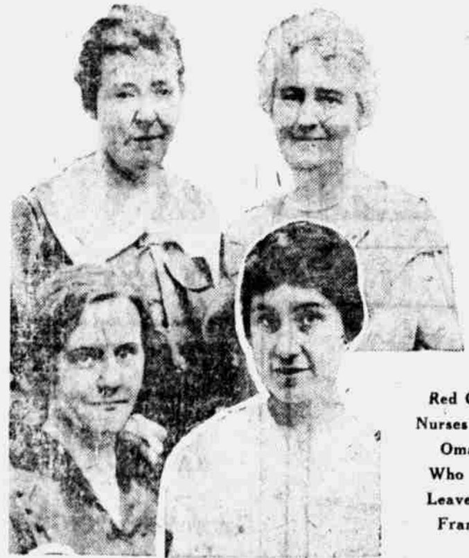
Red Cross Nurses From Omaha Who Will Leave for France.