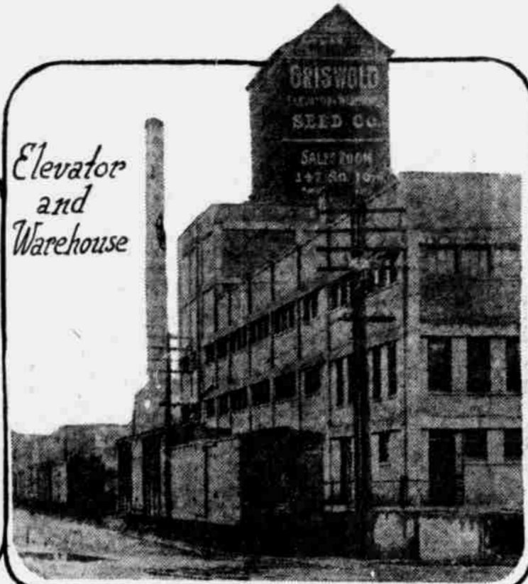
Elevator and Warehouse