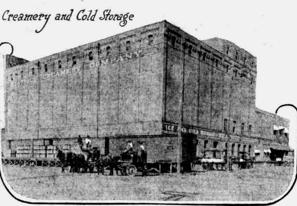
Creamery and Cold Storage