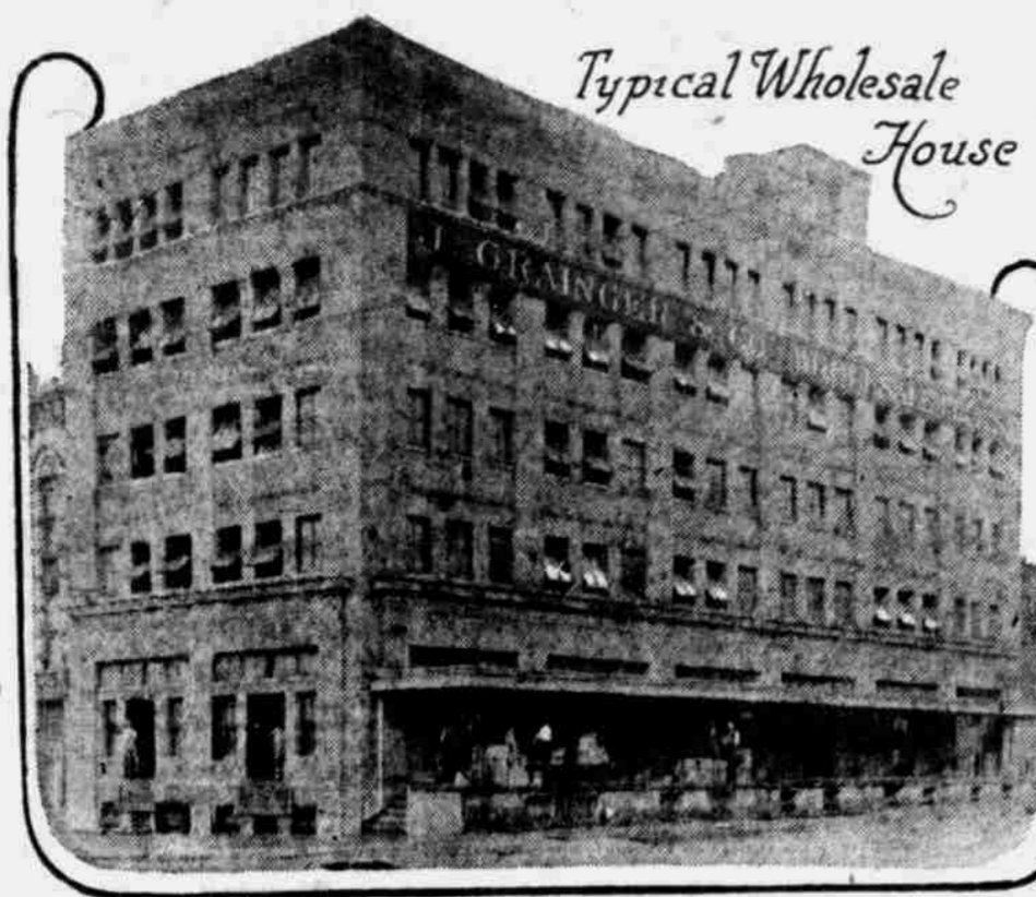
Typical Wholesale House