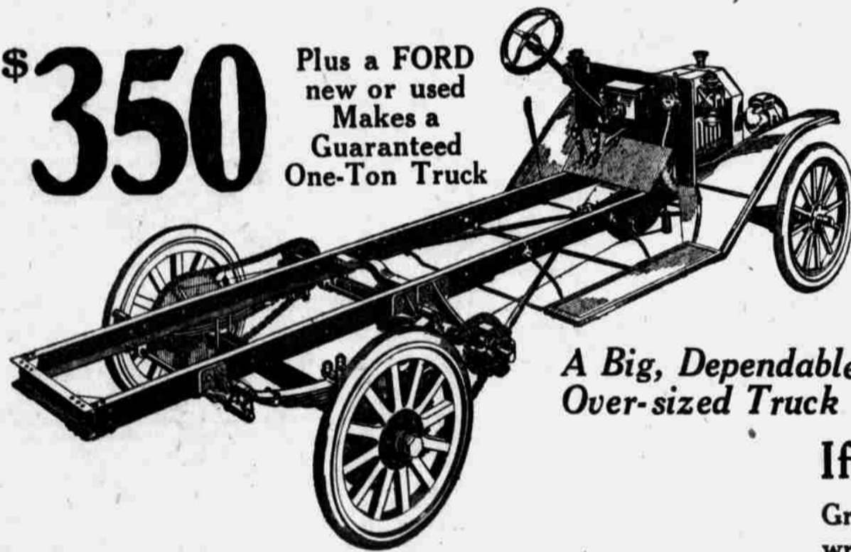
A Big, Dependable Over-sized Truck

$350 Plus a FORD new or used Makes a Guaranteed One-Ton Truck