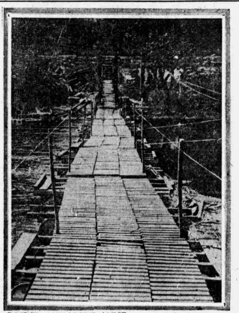
BRIDGE ACROSS THE AISNE.