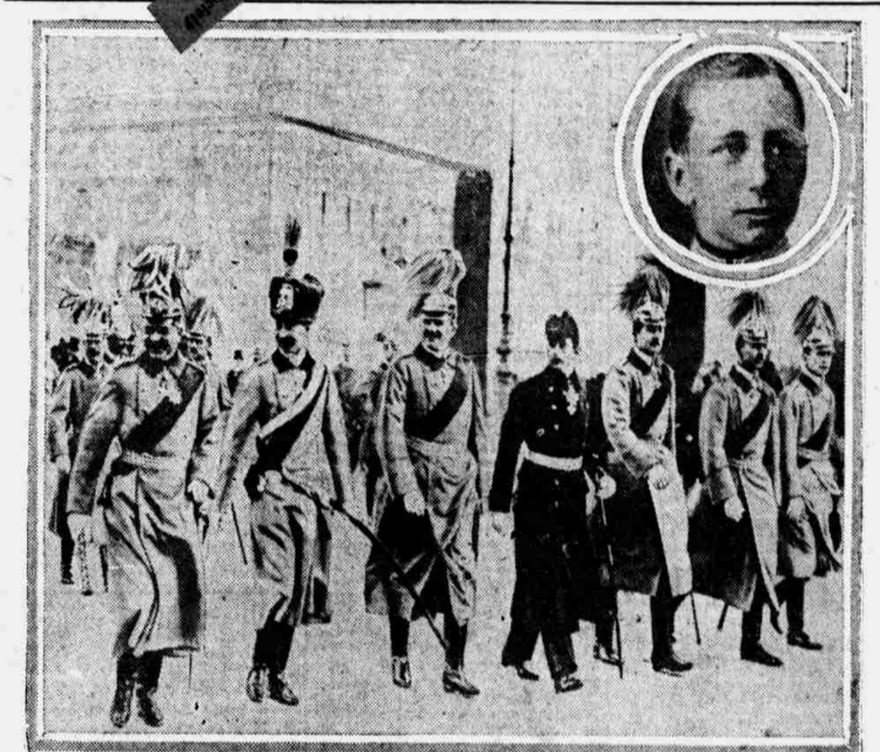
KAISER AND HIS SONS. Kaiser German war lord and his sons photographed at a military review. At the end of the line is Prince Joachim, the youngest son. A "close-up" of Prince Joachim is shown in inset.