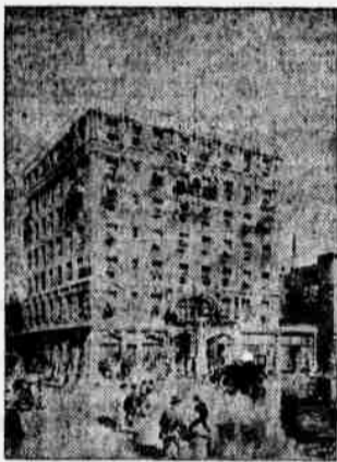
Architect's Drawing of 7-Story Hotel Building Now Under Construction at Kearney, Neb. BANKERS REALTY INVESTMENT COMPANY, ARCHITECTS AND BUILDERS.

The hotel building which is now being erected in this city by this company is to be of absolutely fireproof construction, and in its arrangements and appointments the very latest ideas in modern hotel building and operation are being provided. Including every modern feature such as telephone and hot and cold running water and private baths in guest rooms, vacuum cleaning and refrigeration machinery, elevators, etc., etc.