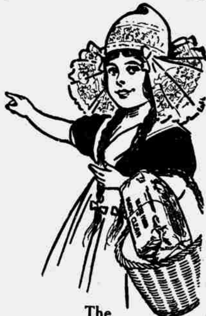
The JAY BURNS BAKING CO. 20th and Cuming Streets

These pure, clean breads constitute the most perfect and at the same time the most economical of foods. Yielding on the present basis of cost—four times the nourishment of potatoes, five times that of fresh meat, six times that of milk, eight times that of eggs.