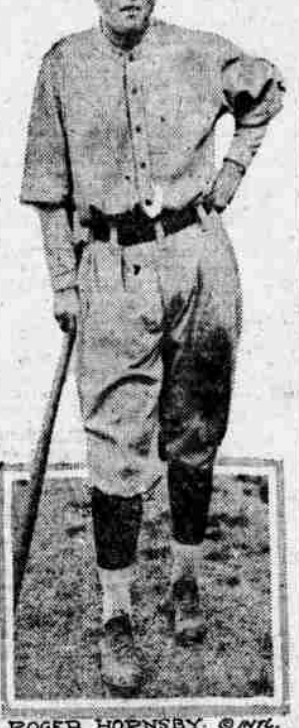
ROGER HORNSBY.

Roger Hornsby, the crack batter of the St. Louis Cardinals, in spring training at San Antonio, Tex.