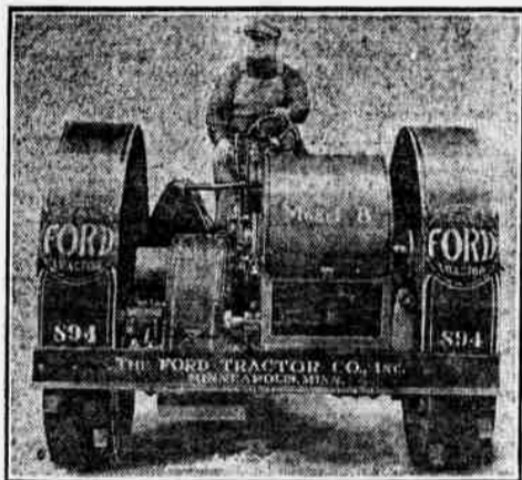
"The machine the world has been waiting for."

The Ford Tractor Company of Minneapolis, Minn., is engaged exclusively in the manufacture of THE FORD FARM TRACTOR, and has no connection whatever with the Ford Motor Company of Detroit, or with any other automobile or tractor concern.