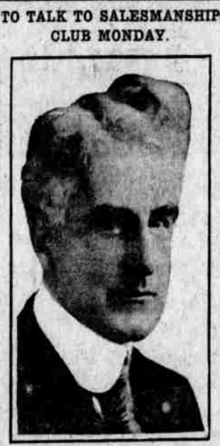
F. HAPPY DAY

Friend Defeats York. Friend, Neb., March 3.—(Special.)—The Friend basketball team defeated the York team yesterday afternoon at the York Y. M. C. A. building. The game was a close one, but the Friends won by a score of 17 to 15. The game was played in the gymnasium of the York Y. M. C. A. building. The game was a very interesting one and was well attended.