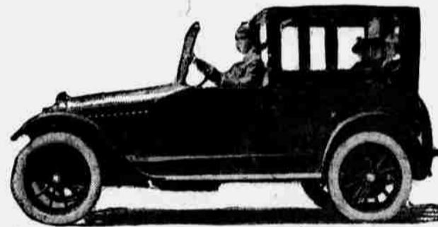
SEVEN PASSENGER TOWN CAR