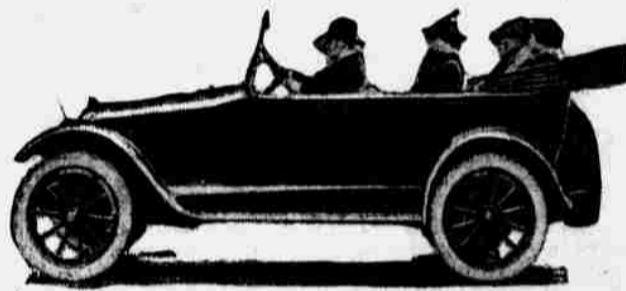
SEVEN PASSENGER TOURING CAR