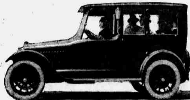
SEVEN PASSENGER LIMOUSINE