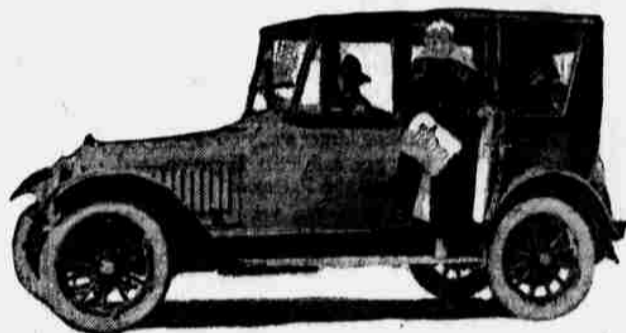
SIX PASSENGER SEDAN