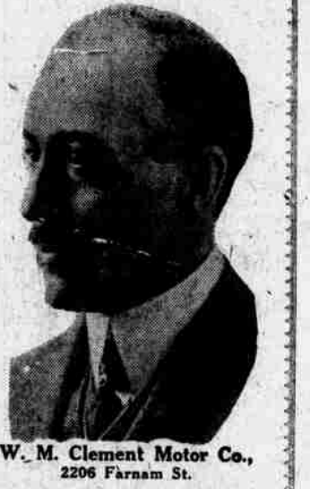
W. M. Clement Motor Co., 2206 Farnam St.

We are confident that the new year will be a happy one for them through pride of ownership and they will ride lightly and luxuriously.