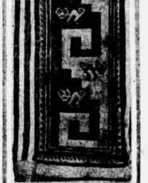
A shawl with border of wool from Peru. The figures represent the puma; above, a Peruvian loom with unfinished web; bobbins at right contain the weft yarn.