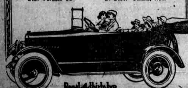
Regal 4 Thirty-two

McIntyre-Hayward Motor Co., 2427 Farnam St. D. 2406. Omaha, Neb.